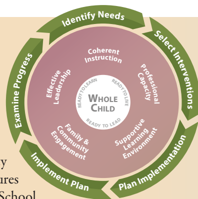
Georgia’s Systems of Continuous Improvement

Georgia’s Systems of Continuous Improvement is a framework that places the “Whole Child” at the center while organizing the process of school improvement within five systems. One of the five systems focuses on Family and Community Engagement which has six structures. These structures are based on the National PTA Standards for Family-School Partnerships.