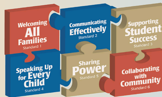
Standards for Family-School Partnerships

Family Engagement Partners receive monthly emails from the Family-School Partnership Program, like the one shown here, with valuable resources and timely notifications.